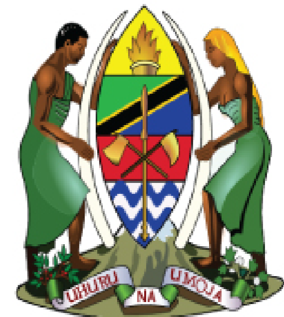
WIZARA YA MAMBO YA NDANI YA NCHI