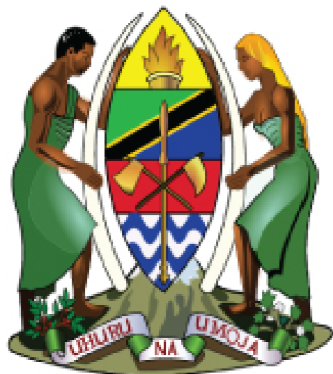
WIZARA YA UJENZI NA UCHUKUZI